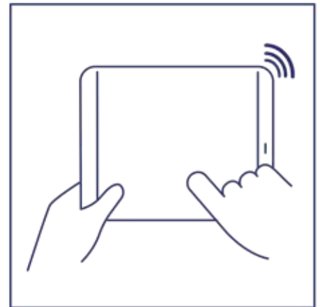
3. Configure the network via the App.