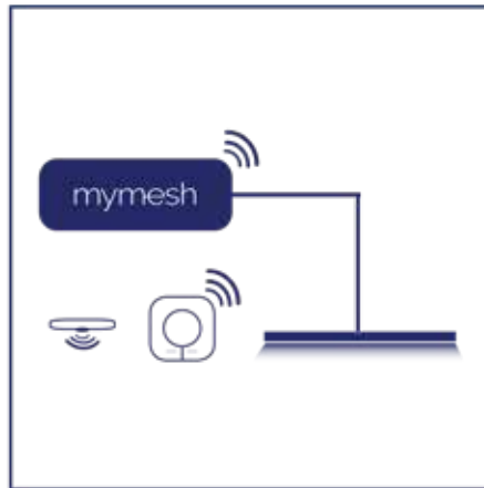
2. Add sensors and switches